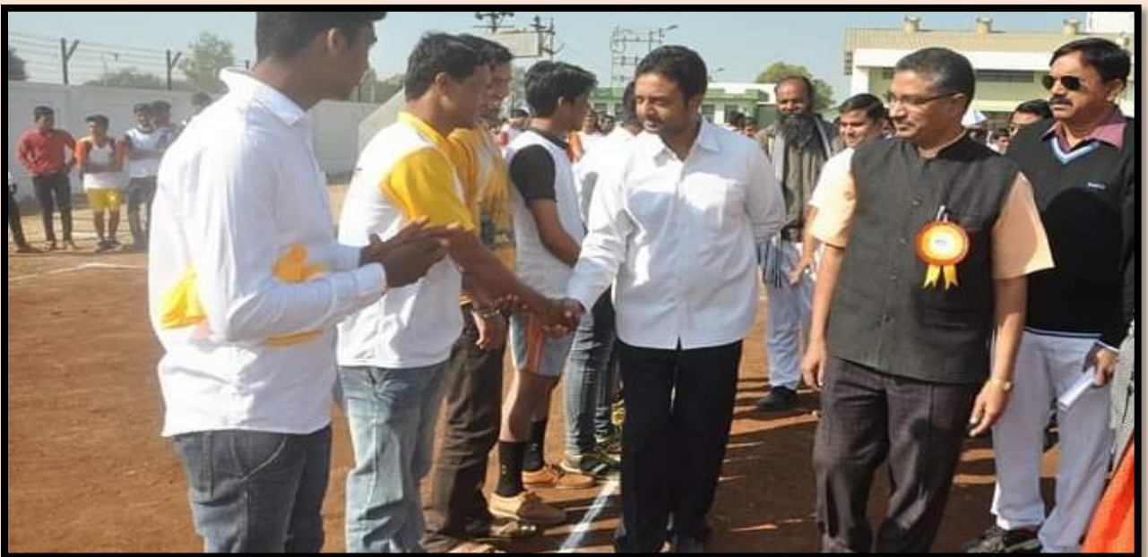
Chief guest encouraging players.